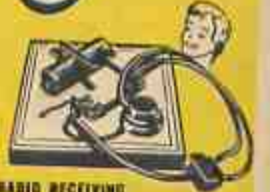
RADIO RECEIVING SET FOR SCOUTS